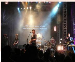
Starfield led worship at the YS National Youth Workers event. Over 10,000 youth workers were encouraged to continue to make a difference in the lives of students.