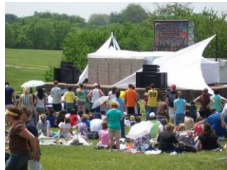
Paradise was a beautiful gathering of 2,500 students and adults who came together in Kansas to worship King Jesus in all of His majesty. It was a beautiful event where God's Word led the celebration. Everyone gathered around the throne and prayed and sang and worshipped.