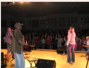
RHM's Jumpstart event was a beautiful display of life-change for hundreds of students in Jamestown, NY.

You helped to make these events (and more) happen this year. THANK YOU. Please pray about giving a year end gift to OtB and how God might lead you to be part of our team again in 2009. We are so very grateful for you,