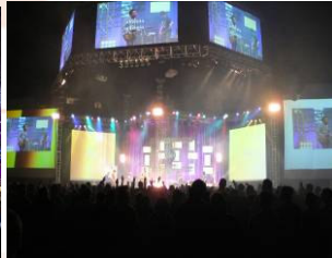
This year's production palette was truly breathtaking. 7 screens and 15 flat screen TVs formed our canvas at NYWC in Nashville.