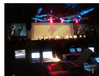
Nearly 7,500 came to New Awakening 2008. The themes of Glory of the Lord, Repentance, Reconciliation, and Revival were the anthem for this powerful event.