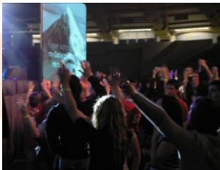
2,000 kids worship after an invitation. 400+ students came forward at Xtrav to accept Christ and ask for prayer.

This Christmas season we are reflecting on the birth of our Lord and Savior. As a result of that birth, Jesus' life and ministry, and His calling for us to serve others, we find ourselves in ministry today. In 2008, that translated to 28 events and at least 28 video projects, of which Outside the Box Ministries was able to be a part. (In our next letter we'll share more about what's involved in a "video project.") We are so thankful for you and your partnership in both life and ministry. We hope you enjoy these pictures and that they serve as a reminder of this incredible year of ministry impact that you make possible.