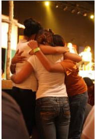
Three girls embrace after hearing the life-changing message of Jesus at RHM's WLS event.