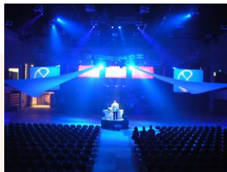
Everyone was shocked when we transformed the Urban Youth Workers Institute into a night club one evening. This event was amazing.