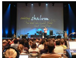
First time that OtB was involved in an event called CCDA. The theme of Shalom was woven throughout the Miami event, and 2,500 attendees were challenged to continue to make a difference in the lives of the poor.