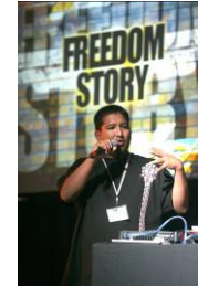
A Native American student shares his Freedom Story at Ron Hutchcraft Ministries' Warrior Leadership Summit.